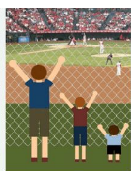
This is everyone being treated equally.